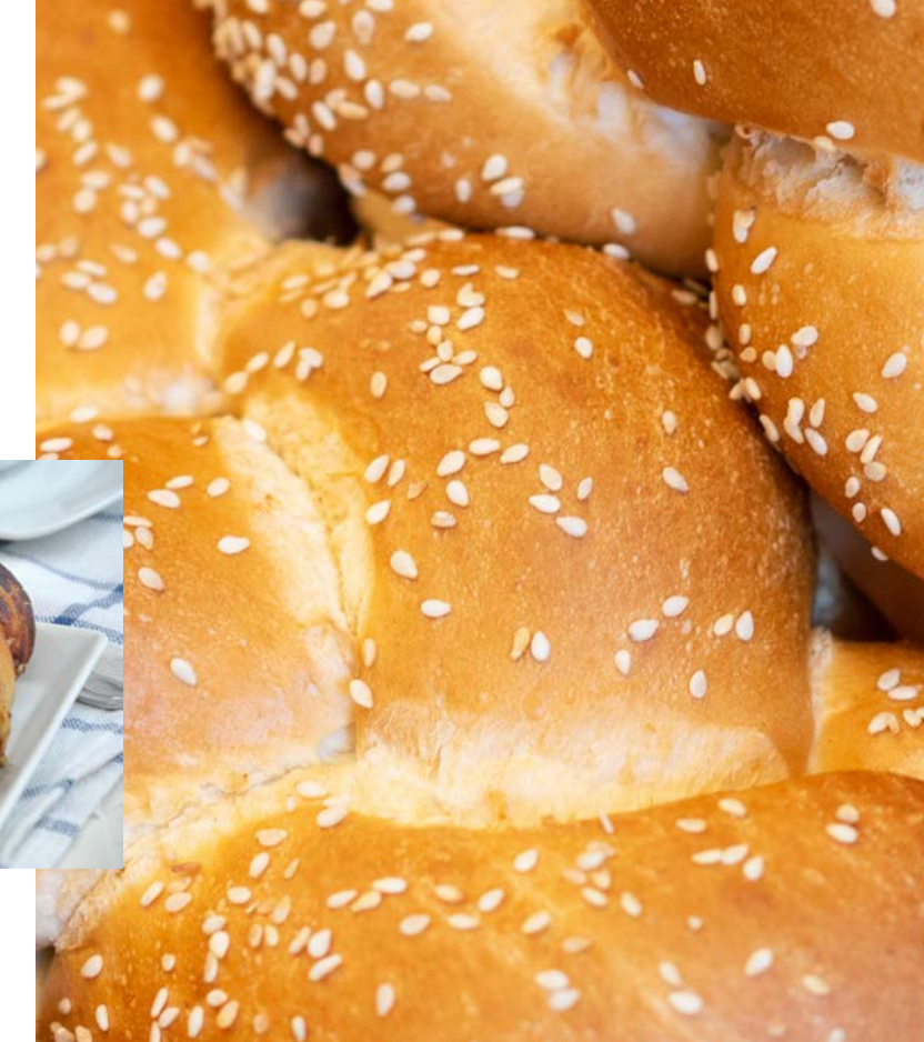
FREE-FROM MAGAZINE | NOVEMBER 2020 | 12