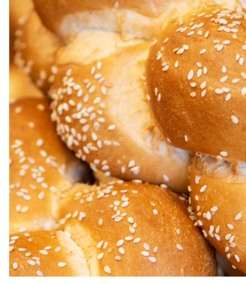
"It is important to find ways that you can meaningfully shape food for yourself."

So whatever your holiday gathering looks like this season, whether it be in person or virtual, with or without tree nuts, remember that you still have agency and power. Traditions are not lost, only modified. Creating new rituals with your family and friends allows you to take control of your food and ensure that the holidays are a memorable, inclusive, and happy time to be together.